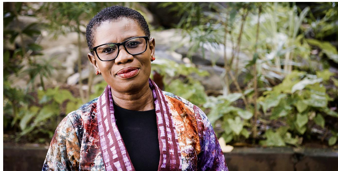
Mayor Yvonne Aki Sawyerr