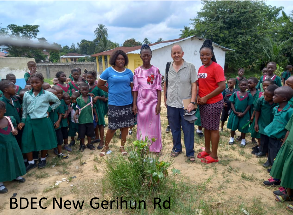
BDEC New Gerihun Rd