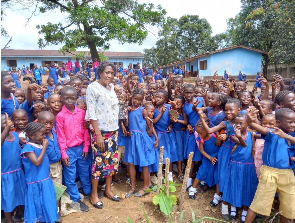
St Peter's Bo No 2