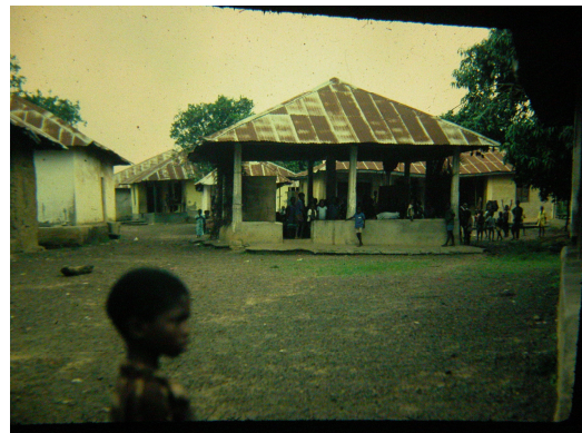
Mamboma School - 1981

There was a map of Sierra Leone drawn on the wall and an 18 year old was doing his GCE's for the 4 th time