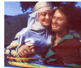
Errol Flynn & Olivia Devilland