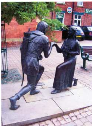
In Nottingham, UK