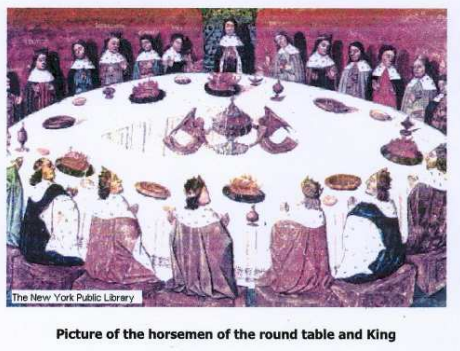
Picture of the horsemen of the round table and King