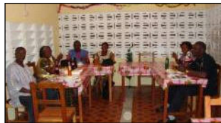
A get together underway in the 'Hut'

We have now turned our attention to how we might ensure that women in Leamington and women in Bo might understand each other's life better.