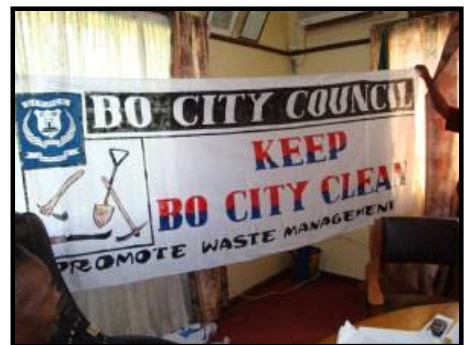
The Local Campaign

Much was achieved during this visit. The spontaneous cooperation and mutual support which took place between the two councils was exciting to witness. The action during the next few months will be crucial for satisfying the high expectation and vision which has been developed.