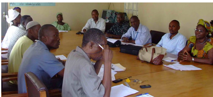
A Waste Project meeting in full session

Procurement is underway with the first of two JCB excavators now ready for inspection pre-shipping. The first skips and skip lorry are due from China next month and the UN has just approved the second tranche of funding to enable a second batch of equipment to be ordered. The Commonwealth Local Government Forum has also approved a £45,000 grant to pay for the technical assistance provided by WCC to the two partner Councils.