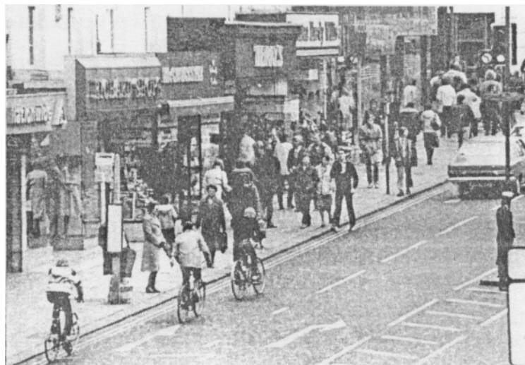
The Parade, Leamington