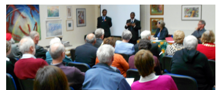
The AGM in full flood

The gathering was a welcome antidote for those of us who feel cold dread at the thought of AGMs! This one was packed with interesting stories and plans, and everyone there - members, dignitaries and members of the public - was thoroughly engaged for the whole two and a half hours.