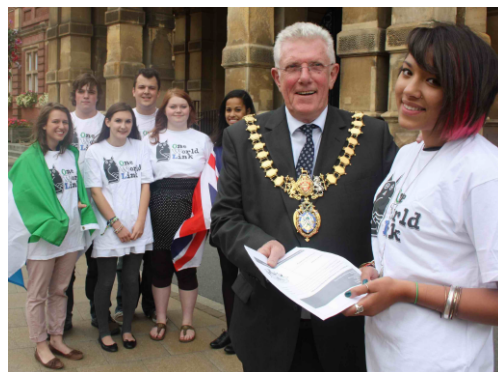
The Team meets up with the Mayor