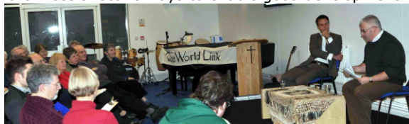
Question time with the experts

They explained how, sometimes, aid and development programmes cannot be long enough to get embedded and enable good local relationships for implementation. OWL's 30 year relationship with Bo, however, meant our development partnership was constantly evolving, with potential for modification to suit local needs. So far, we had achieved a lot - in sanitation, waste management and planning activities. But it was made clear that one of the most effective ways to enable good development in countries like Sierra Leone would be to have much fairer trade arrangements, dropping the subsidies in the North which block imports from the South, and a better global taxation system.