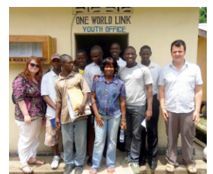
Outside the OWL Youth Office in Bo