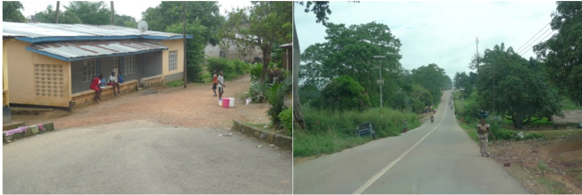
Kissy Town Road