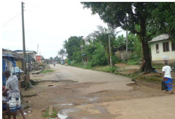
Mahei Boima Road (Between Dambala Road & Fenton Road)